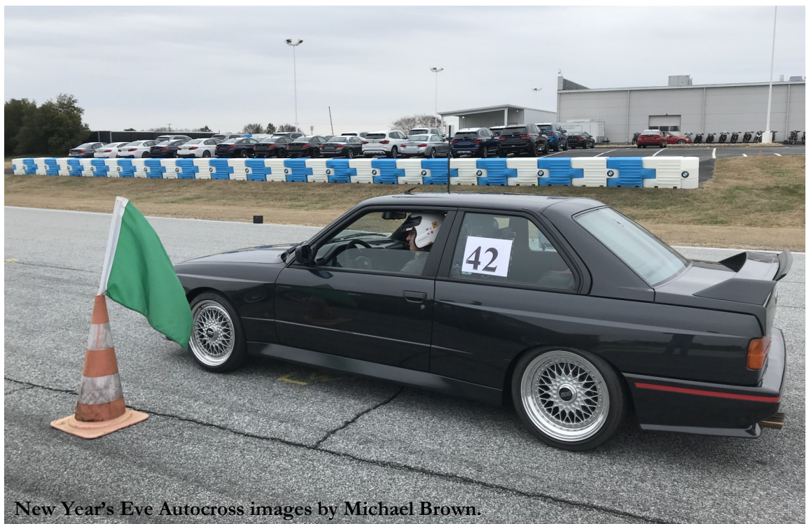
New Year's Eve Autocross.