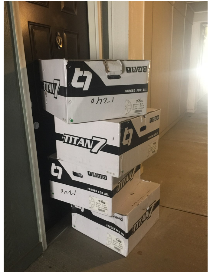
There's nothing like coming home to a set of brand new wheels.

In preparation for the season, I have replaced some critical parts of my cooling system and I began upgrading my suspension to better handle the stresses of the track environment. I also picked up a dedicated set of track wheels and tires, plus I installed some Bimmerworld race studs to help make wheel changes easier. Thankfully, I enjoy working on my car almost as much as I enjoy driving it, so it was a winter well spent. If you have yet to experience your ultimate driving machine on one of the many world class tracks here in the southeast, I highly encourage you to do so. You will not be disappointed! Hope to see you out there!